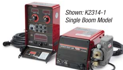
Shown: K2314-1 Single Boom Model