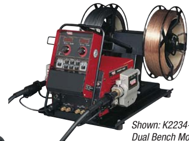
Shown: K2234-1 Dual Bench Model