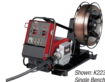
Shown: K2230-1 Single Bench Model