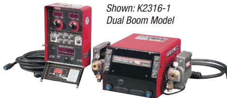
Shown: K2316-1 Dual Boom Model